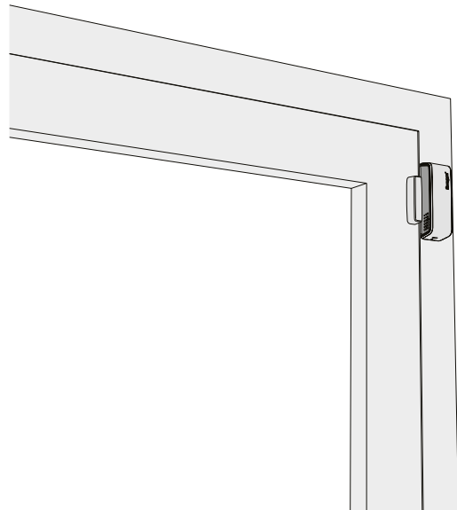
Figure 1. Placement of WISE WCS.