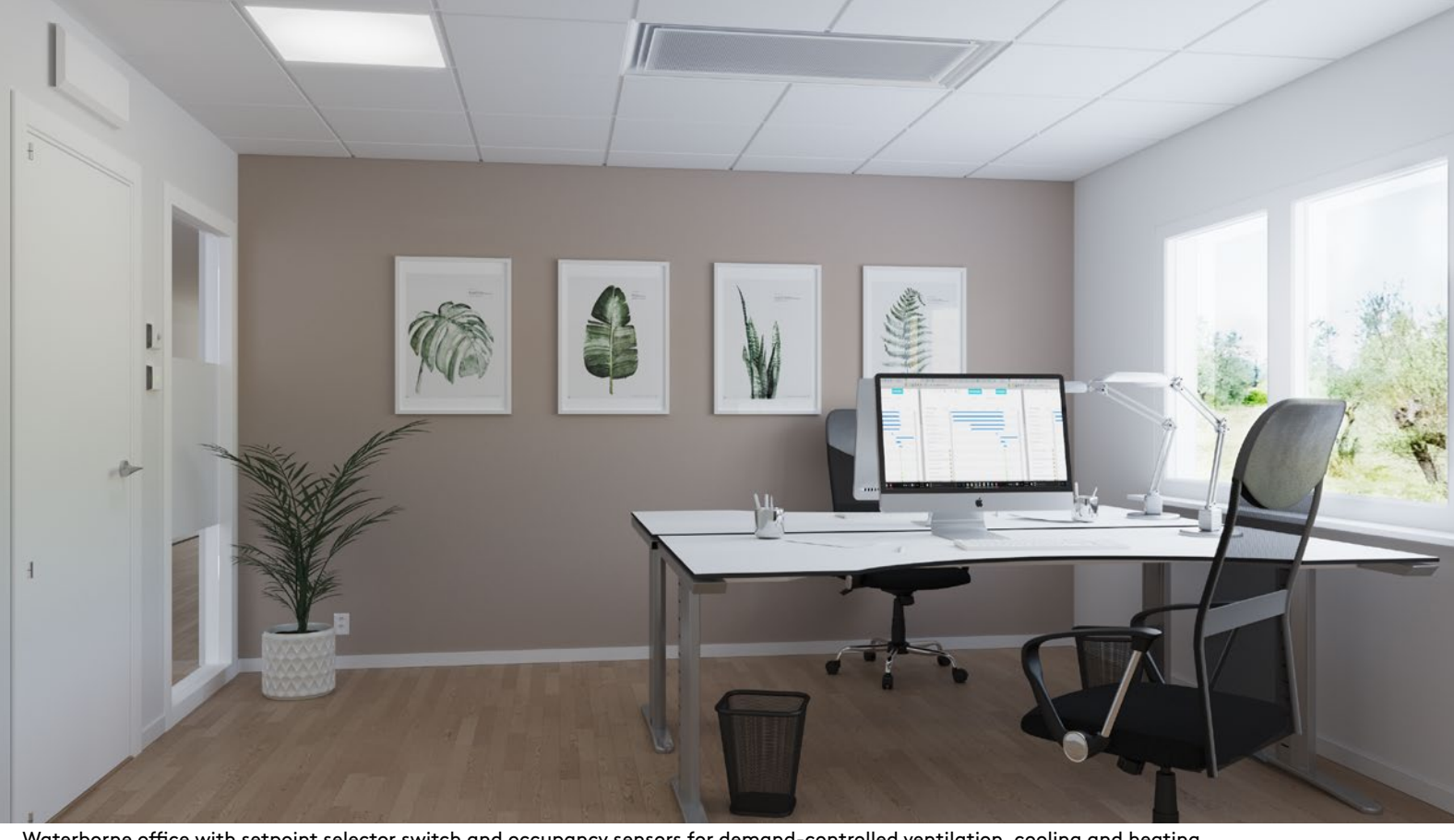
Waterborne office with setpoint selector switch and occupancy sensors for demand-controlled ventilation, cooling and heating.