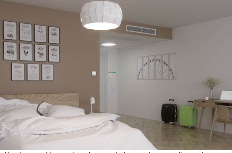
Hotel room with setpoint selector switch, waterborne cooling and heating as well as demand-controlled air regulation. Key card holder for occupancy.