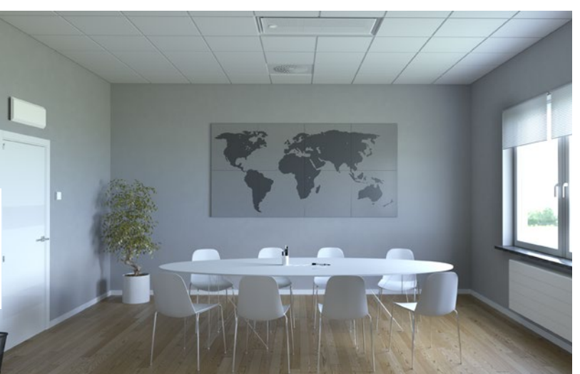
Conference room with setpoint selector switch and demand-controlled air regulation as well as waterborne cooling and control of radiators.