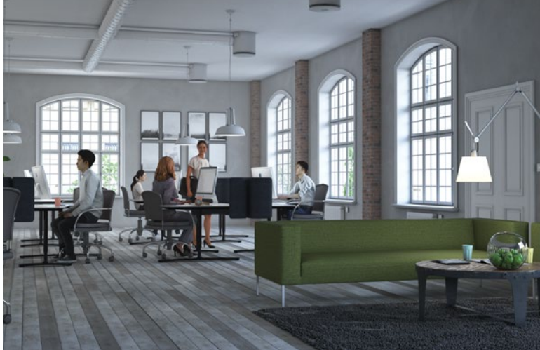
Office landscape with demand-controlled air regulation with setpoint selector switch and control of radiators.